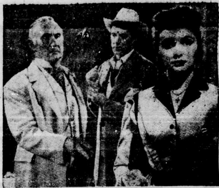
DONALD CRISP, GARY COOPER and PATRICIA NEAL in a scene from Warner Bros. heralded romantic drama, "Bright Leaf." Lauren Bacall and Jack Carson also star in the film which opens June 4 at the Viccar Theatre.

The best "catgut" comes from the intestines of lean, ill-fed sheep, horses or mules.