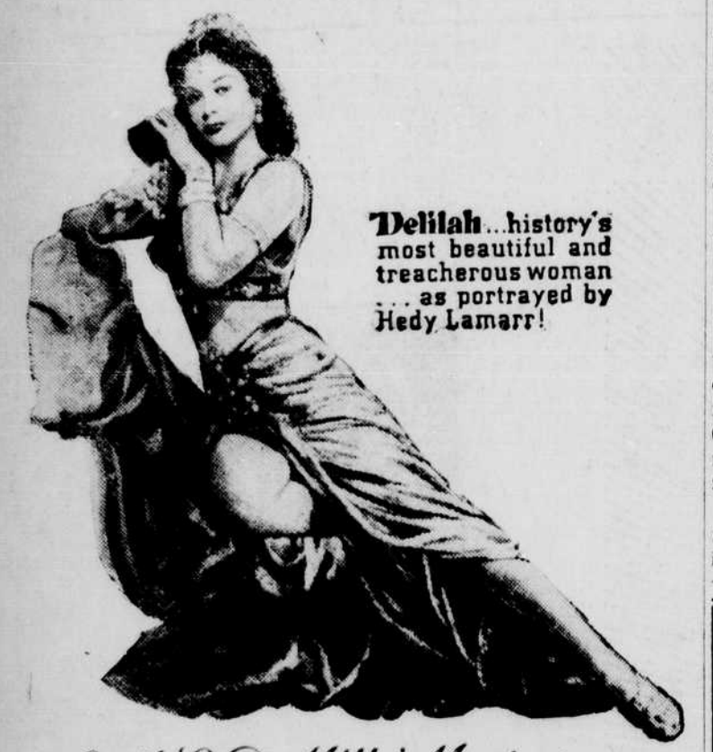
Delilah... history's most beautiful and treacherous woman... as portrayed by Hedy Lamarr!