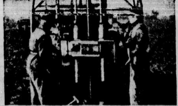
SHOT HOLE drilling machine is used by Sinclair to drill holes for explosive charges, the effects of which are recorded by sensitive Seismograph to map underground formations as deep as 15,000 feet.