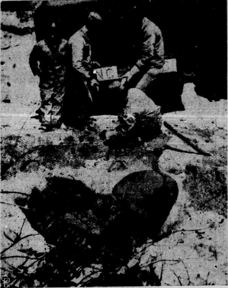
AN ARMY DEMOLITION UNIT unloads and buries anti-personnel bombs and shells near South Amboy, N. J. The missiles were scattered over a wide area during the blast of four ammunition-laden barges. After being sunk in the ground, shells can be exploded harmlessly. (International)

NOW IS THE TIME TO FILL your locker with fryers. The surplus season is here. Store now and save. We have an ample supply. Colonial Frozen Foods. Je 1 2t