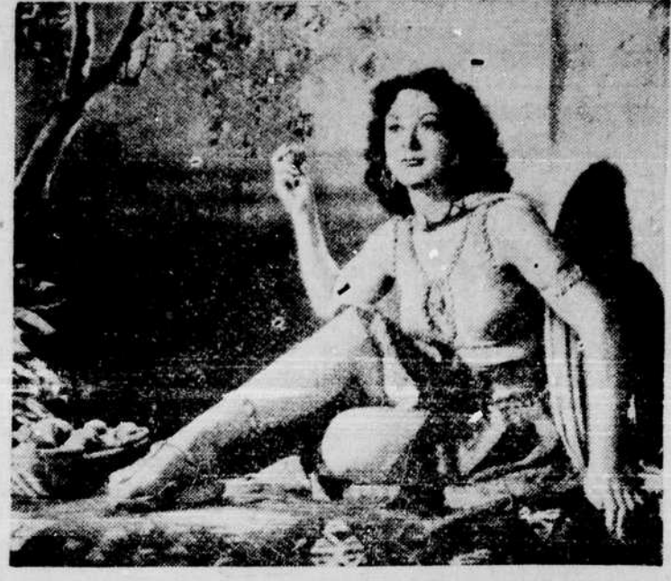
Hedy Lamarr plays the bewitching Delilah in "Samson and Delilah," Cecil B. DeMille's Paramount production in Technicolor now playing at the Watts Theatre. Victor Mature plays the Bible strong man in the film whose cast includes George Sanders, Angela Lansbury and Henry Wilcoxon.

The bonded debt was figured at $42,530, including $14,500 for interest and $28,030 for principal. The new school budget amounts to $218,748, including $100,140 for current expenses, $104,000 for capital outlay, and $14,600 for debt service. According to the budget estimate, the general fund is anticipating revenue other than from general taxation, as follows: Schedule B licenses, $700; beer and wine licenses, $1,000; piccolo licenses, $300; superior court costs, $850; recorder's court costs, $12,000; clerk of court fees, $2,500; sheriff's fees, $2,800; register of deeds fees, $5,200; tax penalties