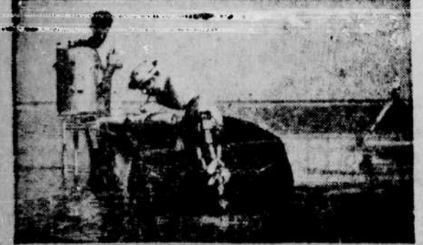
UNDER WATER exploration is yielding new, untapped oil reserves. Picture shows use of the gravity meter, one of the newer scientific tools employed by Sinclair to map subsurface formations.