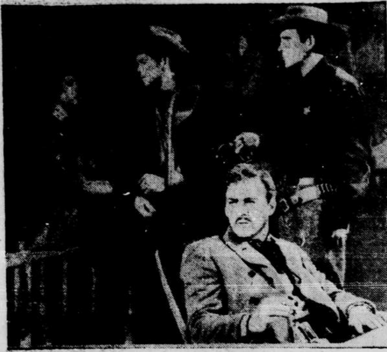
"Brimstone", starring Rod Cameron, Adrian Booth, Walter Brennan, Starts at the Marco Theatre Thursday.

him who is at Post Office in Williamston every Monday and Friday for complete information, or contact the U. S. Army and U. S. Air Force Recruiting Station, Post office Building, Rocky Mount, North Carolina.