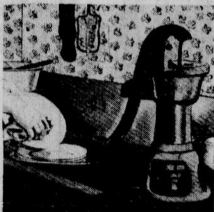
Truly automatic service! —hot water by wire is even more automatic than electric light, because you don't even have to turn it on or off!

A modern, automatic electric water heater will give you a new idea of convenience and thrift, too—it supplies abundant, clock-round, calendar-round HOT water at a cost of only 1c per kilowatt hour on VEPCO's low off-peak rate!