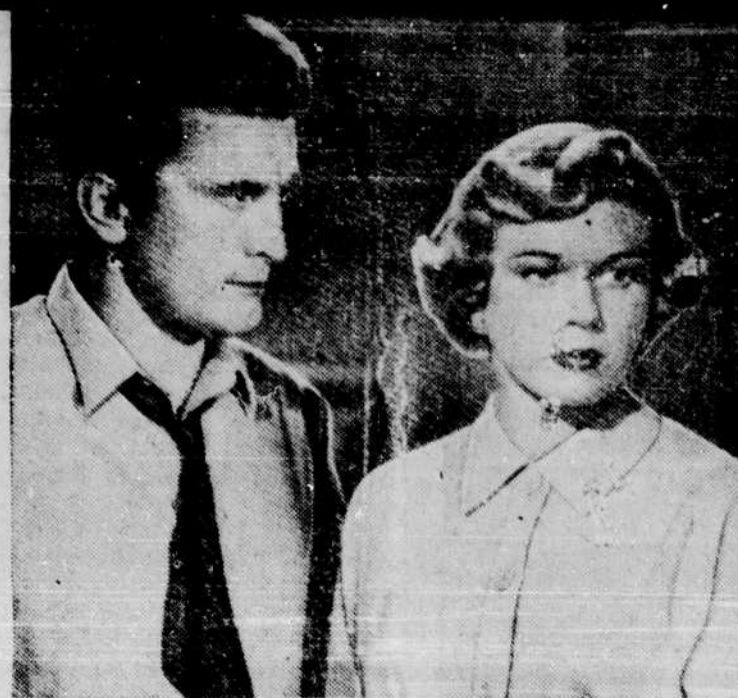
Shown above are Kirk Douglas and Doris Day starring in "Young Man With A Horn" which begins Sunday at the Viccar Theatre.

So far the league is experiencing fair success but due to the lack of attendance the costs of the lights are a heavy burden to the league. The League operates as a non-profit organization and the admission charge is only to defray the expense of the lights. A lot of fun is had by the fans and players at the games and it is a shame the way the citizens of the town don't support the teams. Why not come out to the park to-night and root your church team on to victory. Not only tonight but every night. Its a grand evening of entertainment.