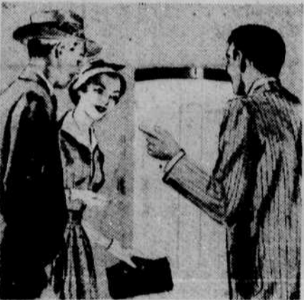
Get one big enough! —let your electrical appliance dealer or your plumber advise you as to the right SIZE and type for your family!

Now see the style-star of an all-star line...the new Chevrolet