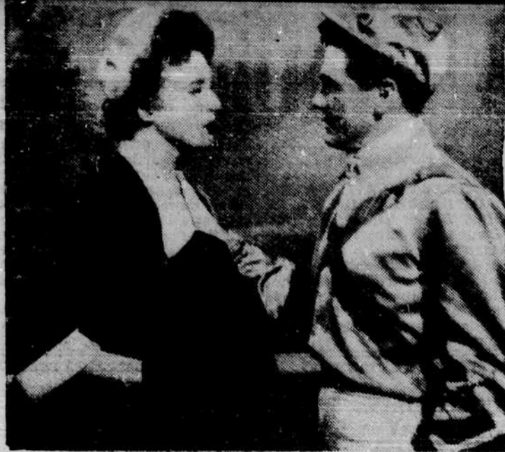
That girl is Micheline Prelle, famed French film star making her American debut as a Parisian cafe entertainer in the Twentieth Century-Fox drama "Under My Skin," based on an Ernest Hemingway story. The jockey, all decked out in his racing silks, is John Garfield. The drama of turf and heart opens Sunday at the Marco Theatre.