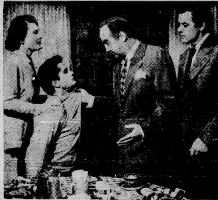
Dishonor begins at home! Broderick Crawford slaps his son, John Derek, in this scene from Robert Rossen's production of "All The King's Men" at the Vicar Theatre. John Ireland and Anne Seymour also appear in the Columbia picture beginning Sunday.