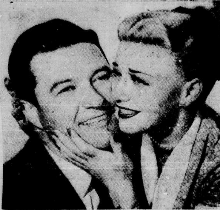
Dennis Morgan and Ginger Rogers team romantically for the new Warner Bros. film, "Perfect Strangers," which begins its engagement at the Viccar Theatre on Sunday. Morgan and Miss Rogers shared the romantic leads in "Kitty Foyle," a few years ago.