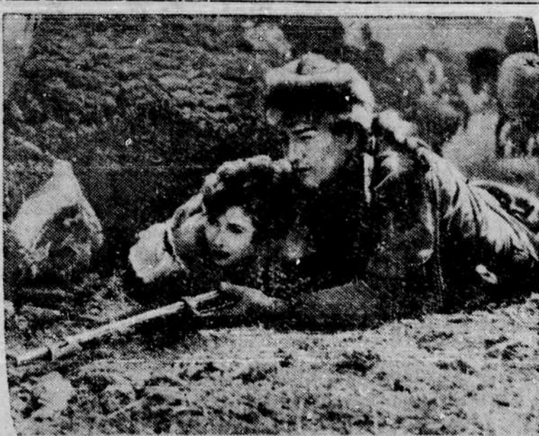
ROBUST ADVENTURE... in a scene from "The Fighting Kentuckian," Republic film which starts a two-day engagement Thursday at the Marco Theatre. Vera Ralston and John Wayne are starred.

GUARANTEED BLACK PANTHER THEY ARE KILLERS! Black Panther Garden Dust (Contains Rotenone) Use as Dust or Spray. Black Panther Delux Spray Guaranteed to Kill DDT Resistant Flies. Black Panther Insect Spray and 25% DDT. General Insecticide Co. Inc. Sanford, N. C. - Utica, N. Y.