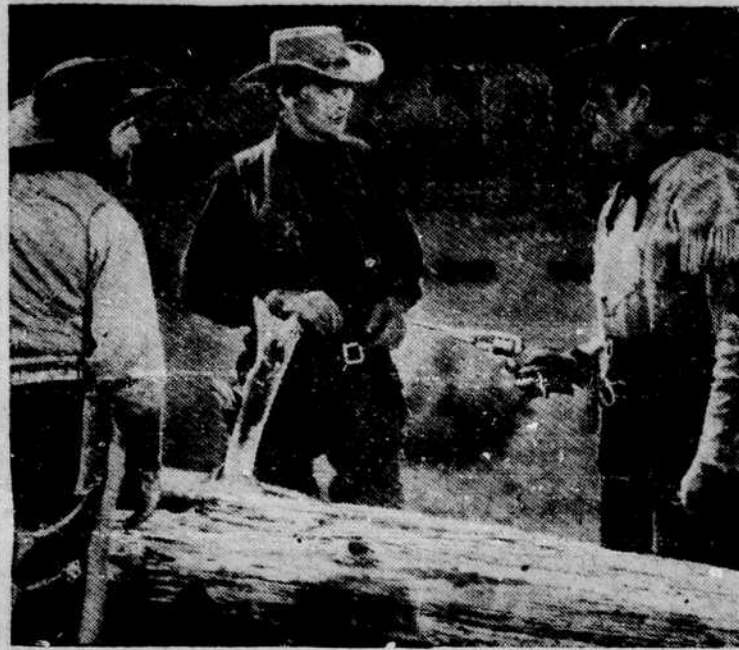
A falling out between bandit-killer Barry Sullivan and wagon train leaders Joel McCrea and James Whitmore provides the action for a tense scene in "The Outriders," M-G-M's exciting Technicolor drama showing at the Watts Theatre Wednesday, Thursday and Friday.