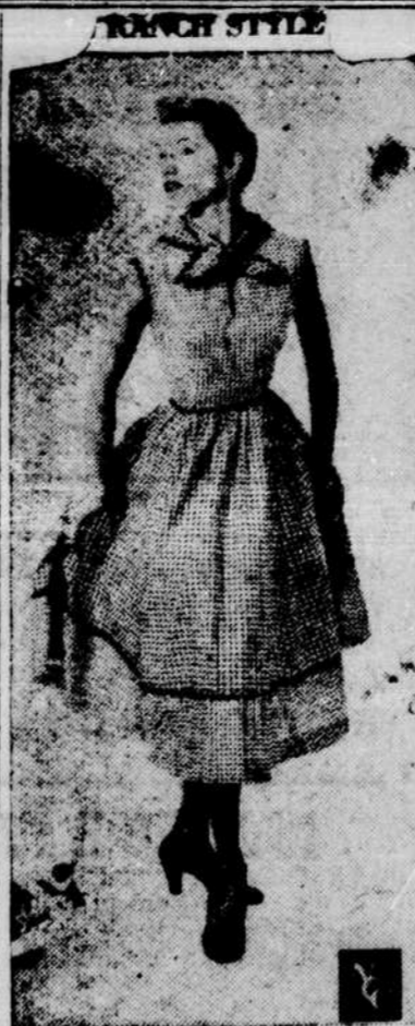
This chic lass takes a cue from the cowboys and wears a Western style kerchief at her neckline. Her dress and matching kerchief are created from sheer swaggar ginghams in neat checks by Gale and Lord. Gingham is more popular for cool summer frocks than ever before, according to National Cotton Council fashion experts.

A master file of all prominent racketeers is being prepared by Senate crime investigators in Washington, it was announced recently. Chairman Kefauver stated that a special committee of the Senate is engaged in compiling a file, cross-indexed, which little by little may piece together a pattern of how these crime operations interlock. Senators can cross check the records of every suspected operator in the world of gambling, narcotics, and other illegal interests. Investigators will use the records to trace the way the underworld operates. The Senate Appropriations Committee made public confidential testimony of F. B. I. Director J. Edgar Hoover, saying that local and national crimes have increased a great deal. Mr. Hoover said that "our crime picture today reflects a much more serious problem than during the pre-war years"