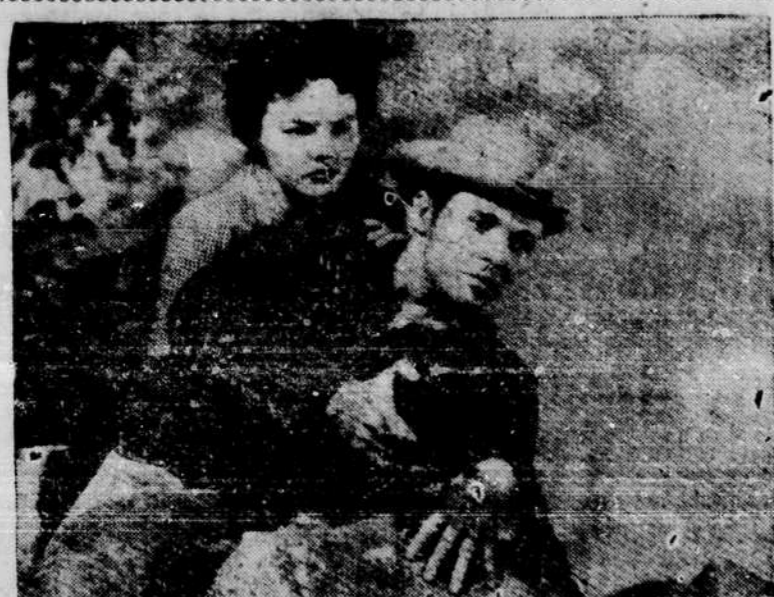
Audie Murphy and Wanda Hendrix head the large cast of Universal International's Technicolor western, "Sierra," filmed in scenic southern Utah. The film's large supporting cast includes Burl Ives, America's Troubador, and Dean Jagger, 1949 "Oscar" winner for his outstanding supporting performance in "Twelve O'Clock High." The film shows at the Watts Theatre Sunday through Tuesday.

At the present time, it appears that Farm Life and Robersonville are still the teams to beat in the loop with Bear Grass managing to stay right close on their heels.