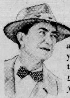
MINOR WATSON "BRANCH RICKEY"

"They'll shout insults at you... they'll come in at you spikes first... they'll throw at your head... but no matter what happens—you can't fight back!"