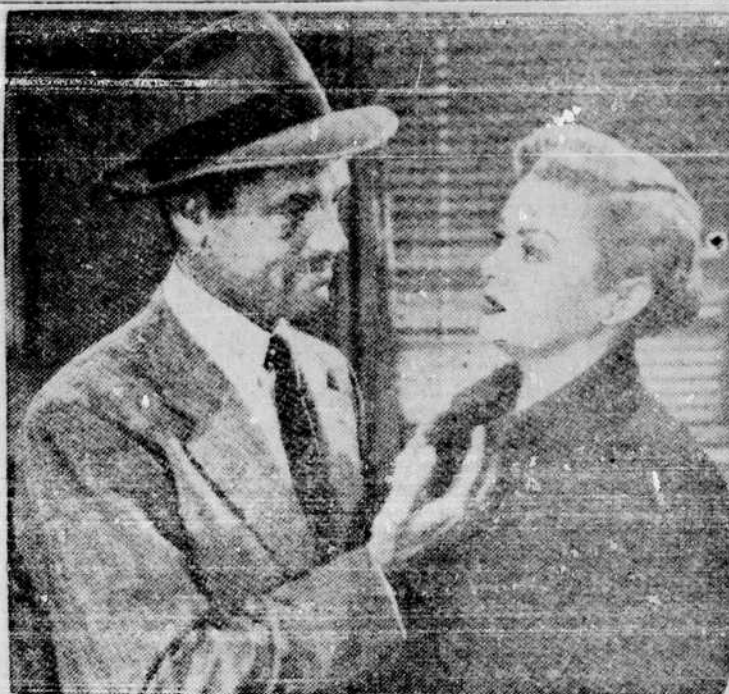
Tom Neal and Adele Jergens are starred in the Lippert Productions' fast-moving story of scientific crime-detection, "Radar Secret Service." John Howard is seen in the leading role. It shows at the Watts Theatre Wednesday.