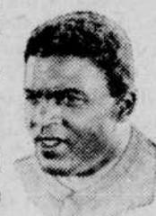
JACKIE ROBINSON "HIMSELF"

"They'll shout insults at you... they'll come in at you spikes first... they'll throw at your head... but no matter what happens—you can't fight back!"