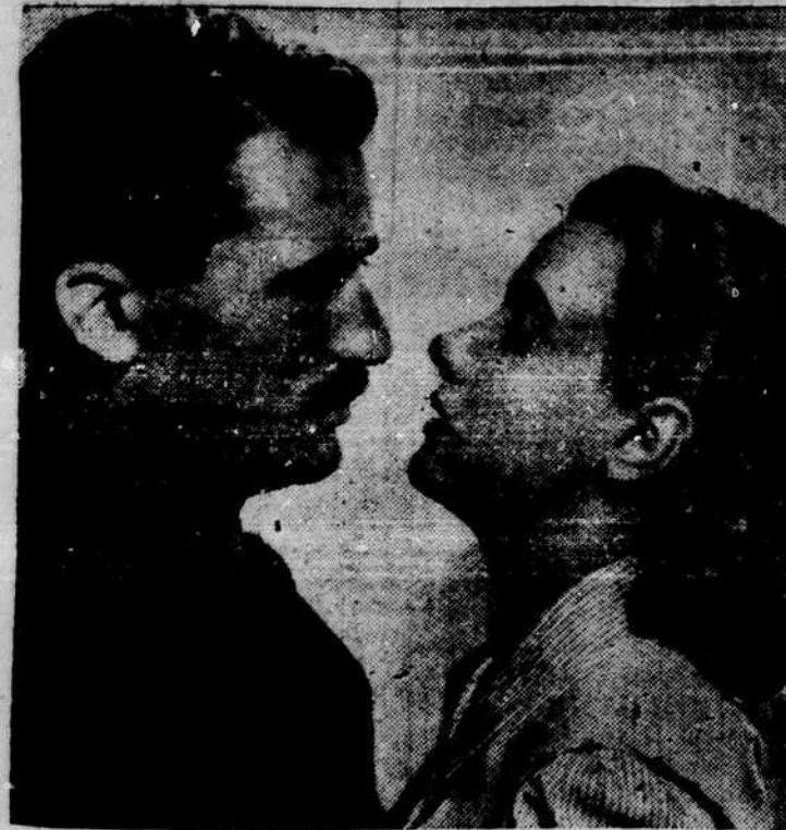
The gunfighter can be a man of passion as well as a man of killing, which Gregory Peck proves in this romantic scene with Helen Westcott from "The Gunfighter," a Twentieth Century-Fox western drama coming on Sunday, Monday and Tuesday to the Watts Theatre.

in a dark room. Because egg shells are transparent the condition an behavior of the yolk, the condition of the albumen, and the size of the air space at the larger end of the egg are clearly visible when held in front of the bright light. The best cold storage plants today use eggs of good quality which are cooled promptly and held under most favorable conditions of temperature and humidity, to protect and retain their original quality. More than half the total egg supply of the year is produced