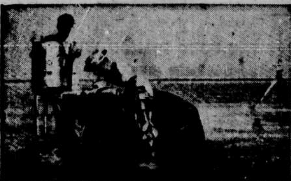
UNDER WATER exploration is yielding new, untapped oil reserves. Picture shows use of the gravity meter, one of the newer scientific tools employed by Sinclair to map subsurface formations.