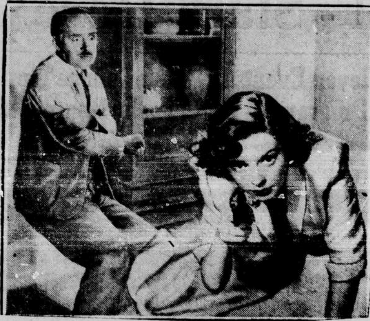
Deadlier than the male is Jane Greer, when in an encounter she wounds John Qualen in RKO Radio's suspense packed romance, "The Big Steal." Miss Greer co-stars with Robert Mitchum and William Bendix in the drama at the Marco Tuesday and Wednesday.