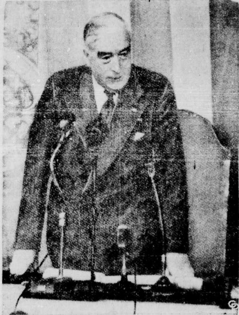
THE U. S. HOUSE OF REPRESENTATIVES is told by Prime Minister Robert Gordon Menzies that Australia and New Zealand will send a "first-class combat force" of undisclosed size to South Korea "within a few weeks as possible." At this special House session, the Premier adds his hope that eventually all British Commonwealth forces will fight together as a group against the Korcan Communists.