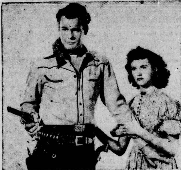
Sunset Carson proves excellent protection for Peggy Stewart in Republic's re-release western, "Cod Of The Prairie," at the Marco Theatre Saturday.