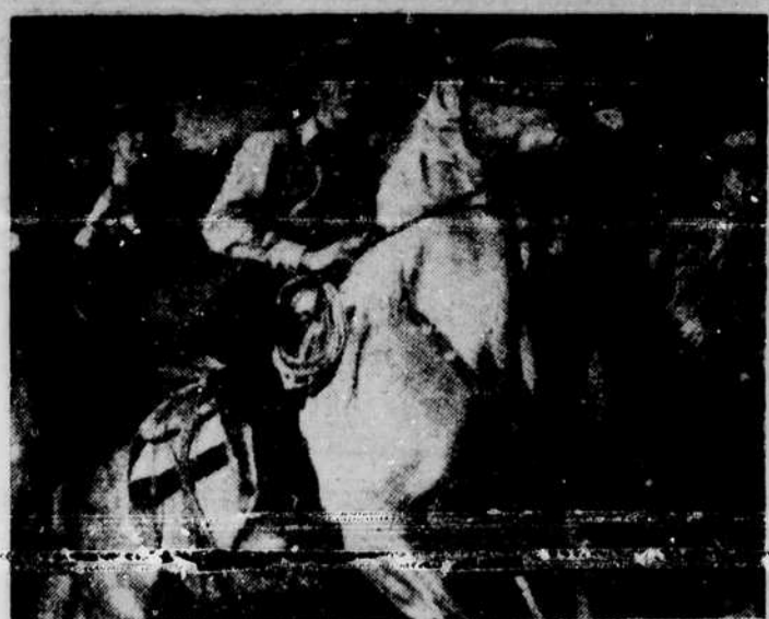
ACTION is the order of the day in Renard's "Renegades of the Rio Grande." Here are Fuzzy Knight, Rod Cameron, star of the film, and Eddie Dew in one of the many exciting scenes.

Bystanders assisted him to his feet and soon asked him if the dog had hurt him.