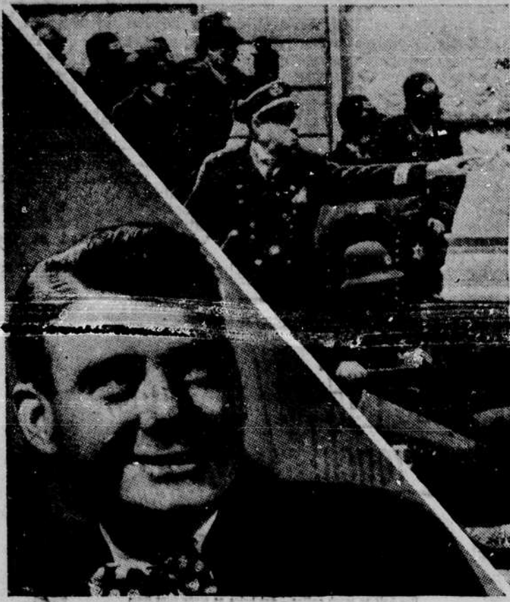
NOSTALGIA ON FILM! (Below) As radio star Arthur Godfrey takes to the principal narrating chores, (above) the Keystone Cops take to the road in pursuit of fast-paced hilarity—both in Warner Bros. "50 Years Before Your Eyes," at the Vicar Theater Wednesday only.

It seems to this corner that no other Democrat can do otherwise. Registration as a Democrat, and