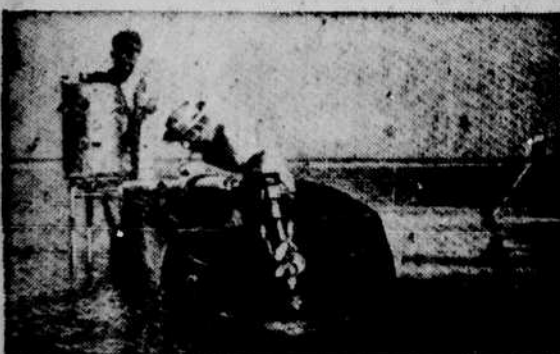
UNDER WATER exploration is yielding new, untapped oil reserves. Picture shows use of the gravity meter, one of the newer scientific tools employed by Sinclair to map subsurface formations.