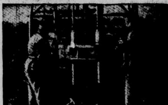
SHOT HOLE drilling machine is used by Sinclair to drill holes for explosive charges, the effects of which are recorded by sensitive Seismograph to map underground formations as deep as 15,000 feet.