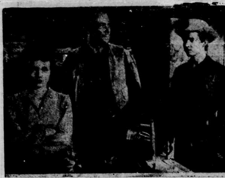
Wanda Hendrix is held captive by Audie Murphy and Dean Jagger in a lonely mountain cabin in this highlight scene from Universal-International's Technicolor western, "Sierra." The new film is Jagger's first screen appearance following his being named the best supporting actor of 1949 for his "Oscar" winning performance in "Twelve O'Clock High." Marco Theatre Thursday and Friday.