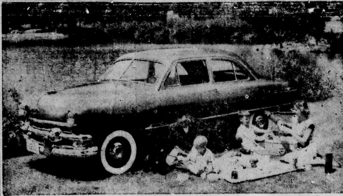
Ford passenger cars for 1951 offer refinements in appearance as well as in mechanical operation, featured by Fordomatic Drive automatic transmission. Above is pictured the 1951 Ford Custom Tudor Sedan.