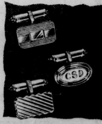
top: $7.50 center: $5.00 bottom: $6.00