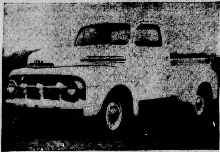
The 1951 Ford F-1 pickup truck and other models in the new Ford truck line feature as optional equipment a new "5-Star Extra" cab for added comfort. An enlarged rear window in all 1951 Ford trucks provides better all-around vision. The steering column gearshift is standard equipment on the F-1 truck. The new cab, with many passenger car features, is sound-proofed with undercoating and roof insulation. Seats, including backs, are adjustable, and cushions have a thick foam rubber pad.

While it was shy in veterans, the line came along fast with Jimmy Myers and Norwood Keel steadying the forward wall. Reginald Coltrain came out for end in his senior year and was good enough by late October to make the all-conference squad. Joe Robertson, working some in the backfield last year, moved to the line this fall