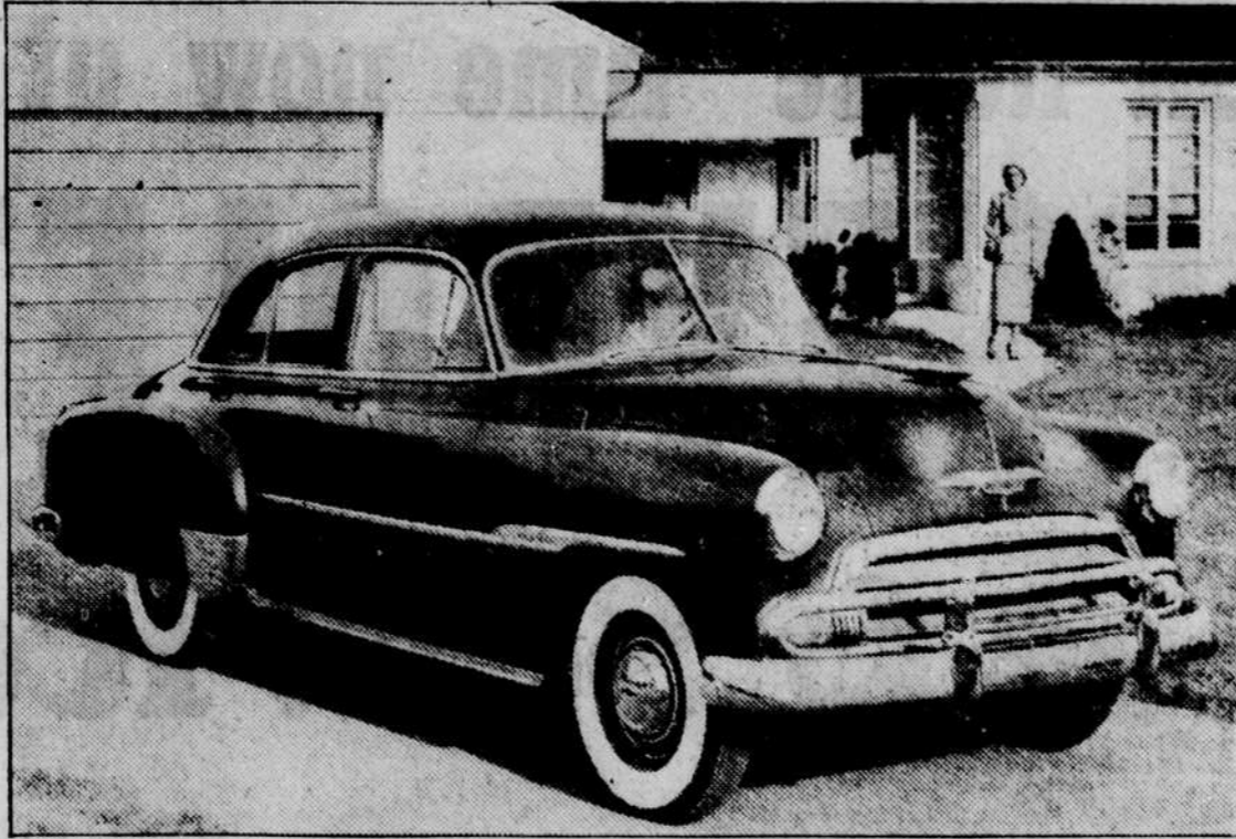
The Styleline De Luxe four-door sedan is one of lower appearance. Radiator grilles have been simplified models introduced by Chevrolet as its passenger field, the accorative body moulding lowered and car line for 1951. Notable in this picture are the rear fender crowns raised. Models also offer added design improvements which accentuate a longer, safety.

virtual elimination of the possibility of brake grabbing are other advantages.