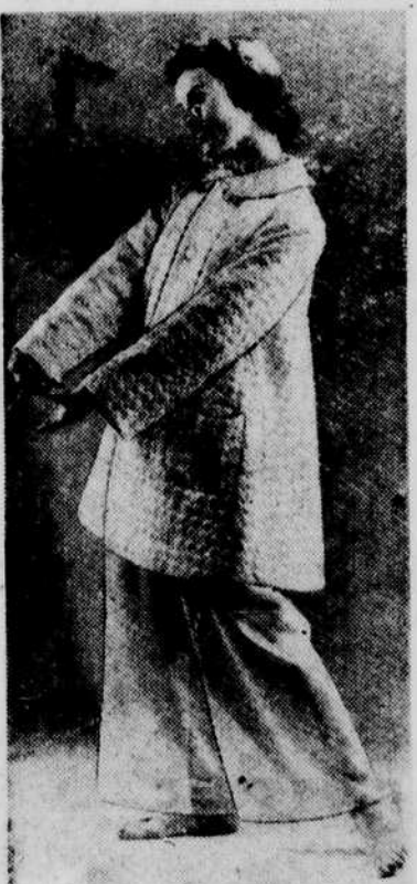
KEEP HER WARM AND PRETTY in a gift shortie robe she'll wear for lounge, and (if she's very young) for study. Above, a quilted knee-length coat in pastel rayon crepe over matching pajamas by Weisman.

Then, when the surprised recipient opens the box, make sure there is a little message, in addition to your love, that tells him or her that "this little key will really take you places, if you'll just step outside the house and find the door it opens."