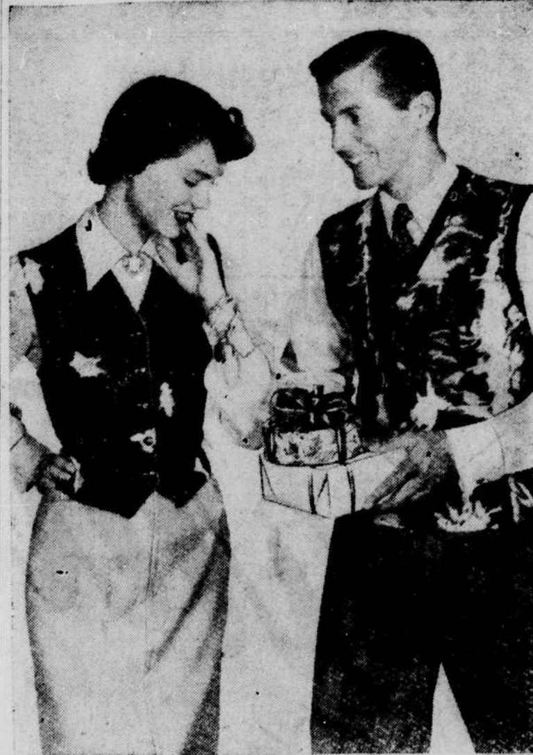
EXCHANGING GIFTS ON CHRISTMAS MORNING means a host of pleasant surprises and the good feeling that comes only with giving. Here, he offers his tokens of the Day to a happy and just a trifle curious young lady. Both are wearing earlier gift arrivals, a weskit for her, a sleeveless pullover for him, both made to look exactly like real fur of Avisco rayon.