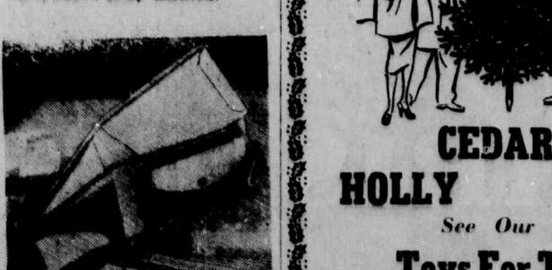
FOR SAFE KEEPING , a bill-fold she'll value for its looks and safety aids. By Buxton.

Above all, let your choice of wrappings this Yule make that little sticker reading "Don't Open Until Christmas"