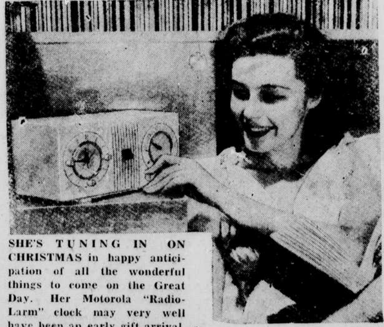
SHE'S TUNING IN ON CHRISTMAS in happy anticipation of all the wonderful things to come on the Great Day. Her Motorola "Radio-Larm" clock may very well have been an early gift arrival.