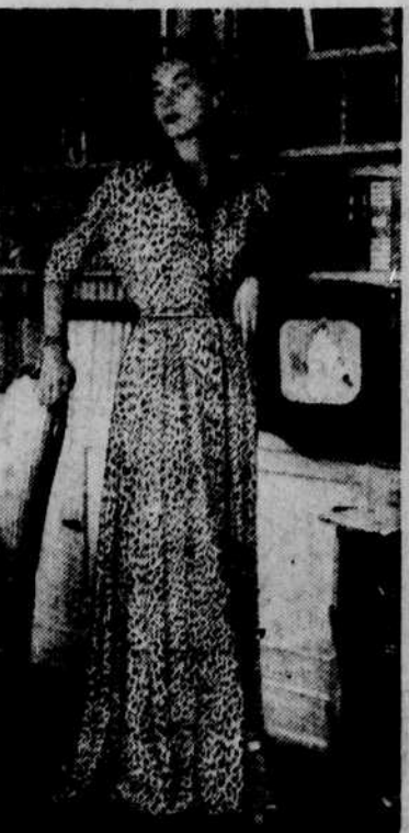
IN THE YULE "SPOT" LIGHT and her Christmas dream come true! A leopard print "Television Gown" for lovely hosting through the year.