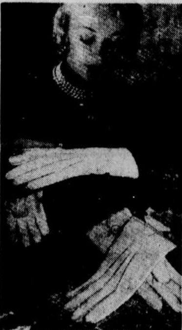
GLAMOUR AT HER FINGERTIPS makes for a truly perfect Christmas! Suggested: gloves to match her every mood and every-occasion need. Gauntlets, and one-button shorties, above, by Kislay.

Choose Robes, Gowns, Slips, Bags, Scarves, Sweaters, Blouses, Gloves, Perfumes, Costume Jewelry and Hundreds of other items from Our Holiday Collection.