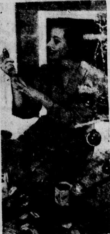
GOOD THING IN A SMALL PACKAGE , especially when it's a Christmas gift of precious perfume to make her feel more glamorous and tell her you think of her as a thoroughly feminine person.