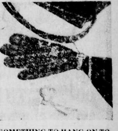
SOMETHING TO HANG ON TO and the prettiest form of insurance against loss is a gift of a gleaming, bejeweled circlet that holds her gloves and purse securely together. By Gluegard.