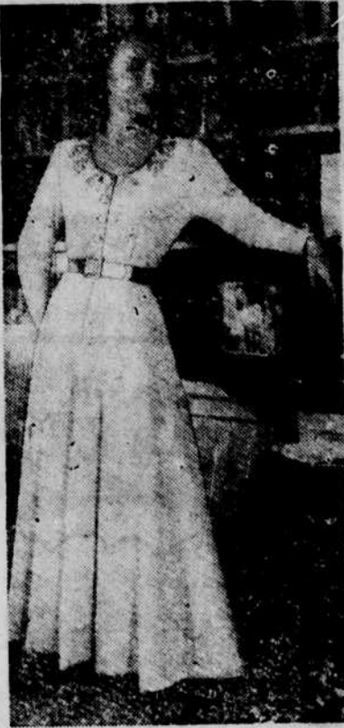
THE TELEVISION GOWN STARS at Christmas and at every television party at which she serves as gracious hostess. The white quilted rayon jersey gown with gold belt and braid trim, above, is by Raymond.