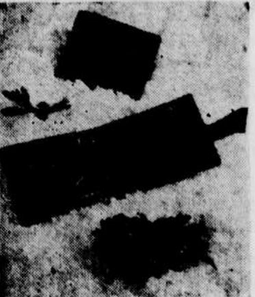
WISHING FOR A WALLET to hold everything—then here's one that holds all of her paraphernalia and even has room for pictures of "Him." It's a Harriet Hubbard Ayer wallet.