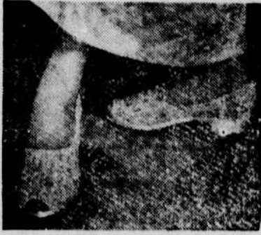
THE GIFT AT HER FEET makes for glamorous comfort around the house through the year when the gift is a pair of slippers in her favorite luxury style, fabric and color. Oomphie slippers above.