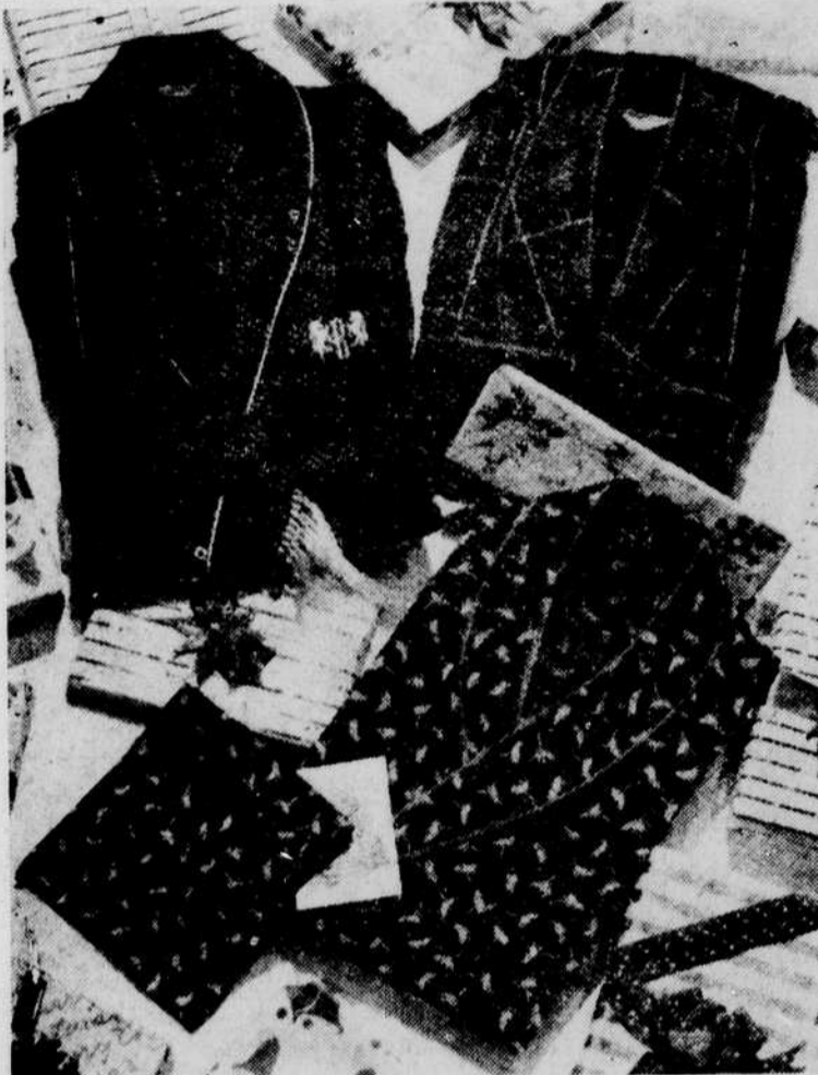
WRAP HIM IN A ROBE THIS YULE and win his loving thanks on Christmas A. M. and for many a day to come. If he's got an eye for fashion, give him one of the new Tartan plaids. If traveling is his forte, select his robe complete with a compact carrying bag. And if he goes for comfort in a big way, then satisfy his yen with a smart flannel style, personalized with his initial. Robes above, by Rabhor.