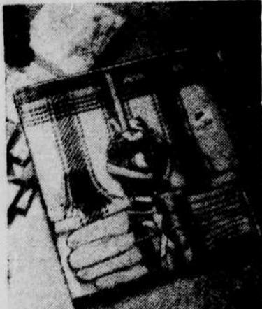
KEEP HIM WARM with a smart all wool muffler and matching knit gloves which can be had as a set neatly boxed. Those shown are by Wilson Brothers.