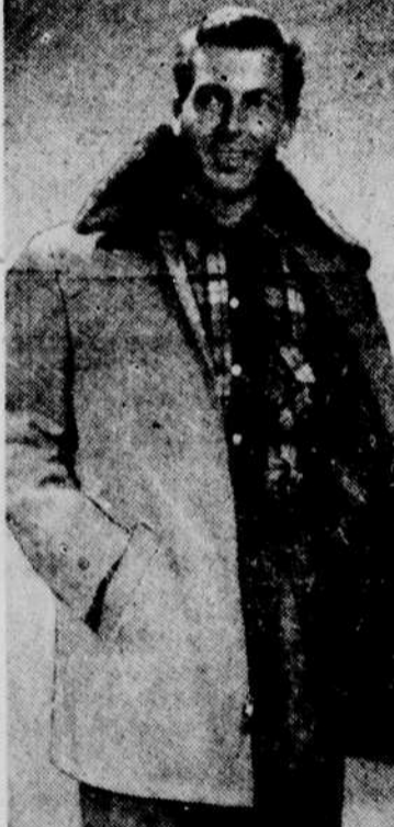
WARM HIS HEART AT YULE-TIDE and keep him warm all-over the Winter through with a snug storm jacket or coat. Above, Misty Millium Jacket of water-repellent rayon with a mouton collar and millium quilted, wool insulated lining by McGregor.