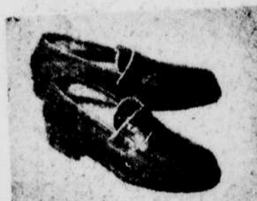
FOR LEISURELY LUXURY it's loafers he wants. And it's a sure bet that he'll grin with satisfied glee when he finds them 'neath his Tree.