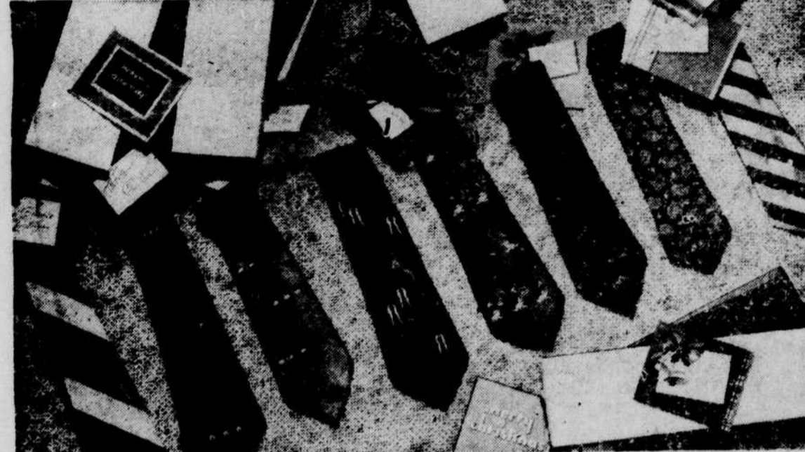
TIE UP HIS CHRISTMAS WITH PLEASURE and we do mean "tie." Figures show that 85 percent of the ties sold throughout the year are bought by women which means that no matter what else, that man of yours will be getting from you this Yuletide, his Christmas will be incomplete without some ties. With a hundred thousand color combinations and forty thousand different patterns available, of which the above are representative, being "tied by you" this Yule will give him pleasure.

with her personality and her favorite activities in mind and be assured that it will be the perfect gift 'neath the tree and the 365 days of the year to come.