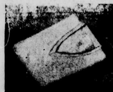
THE COMFORT-MINDED MALE (and what male isn't?) will ever appreciate a sweater. Whether it's meant for sport, spectating or just keeping warm, you can be sure it's a gift he'll give long thanks for.