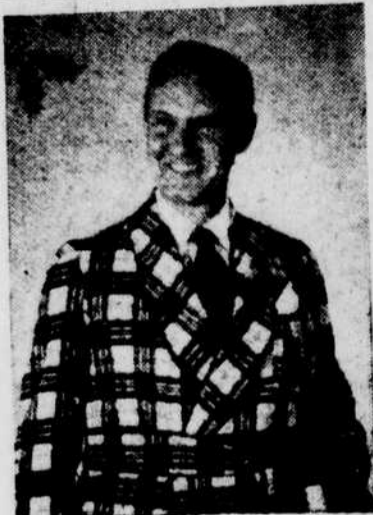
FASHIONABLE INDEED will dad be on Christmas morning if among his gifts is one of the new robes. This one is of light-weight virgin wool in smart and popular Scotch Tartan pattern.