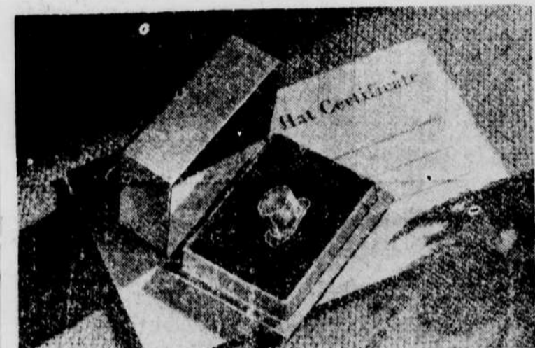
HERE'S HOW TO GIVE HIM A HAT for Christmas, without getting into a diher about whether it's going to fit or not. Just tell the man who waits on you. He'll fix you up with a boxed miniature plus a gift certificate that will give your man a chance to choose his own. Smaller miniatures for hanging on the tree, also are available.