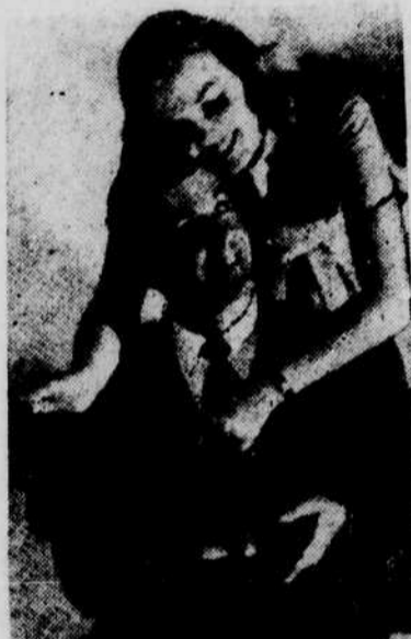
GIVE GOOD GROOMING in the form of utility kits and he'll love it, especially if he gets about a lot. The good guy above is pleased with one by Courtley done in tan leather and fitted with ready to use shaving and hair needs.