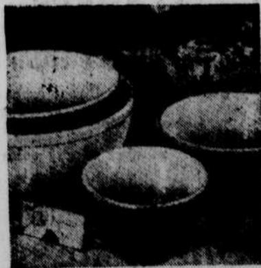
COLORFUL CHEER FOR MOM on Christmas morn takes gala form as a graduated set of gaily hued mixing bowls. These are of Pyrex.

Start her off on the road to a valued collection, this Christmas, with two or three unusual gift plates, an antique pitcher or several pieces of early American milk glass.