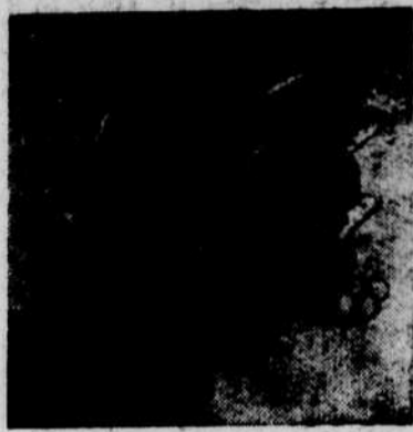
A PING PONG SET may be chosen for one member of the family but you can be sure everyone will enjoy it. Paddles, balls, net and brackets for fitting to the table available in handsomely gift boxed fashion.