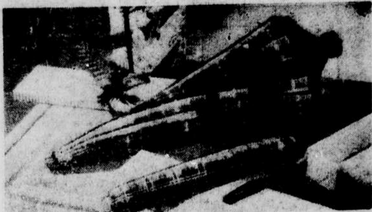
FOR RAINY DAY CHEER! Gay patterns and sunny colors make a gift umbrella the gift of perfection for the gal who's perfection in your life. Select her umbrella in the style most complementary to her own ideas on fashion. The umbrella above comes folded small within its own matching case and can be opened quickly to ward off sudden showers. By Marvel.

Sure to get a welcome, welcome is a record album of their favorite symphony, dance band or play.