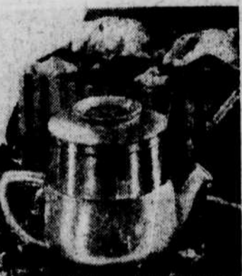
GIFT GIVES TWICE! — And will prove a true conversation-piece Yuletide token, for with the top on it makes coffee, without the top, it doubles as a coffee server or teapot. Tricolorator, shown above.