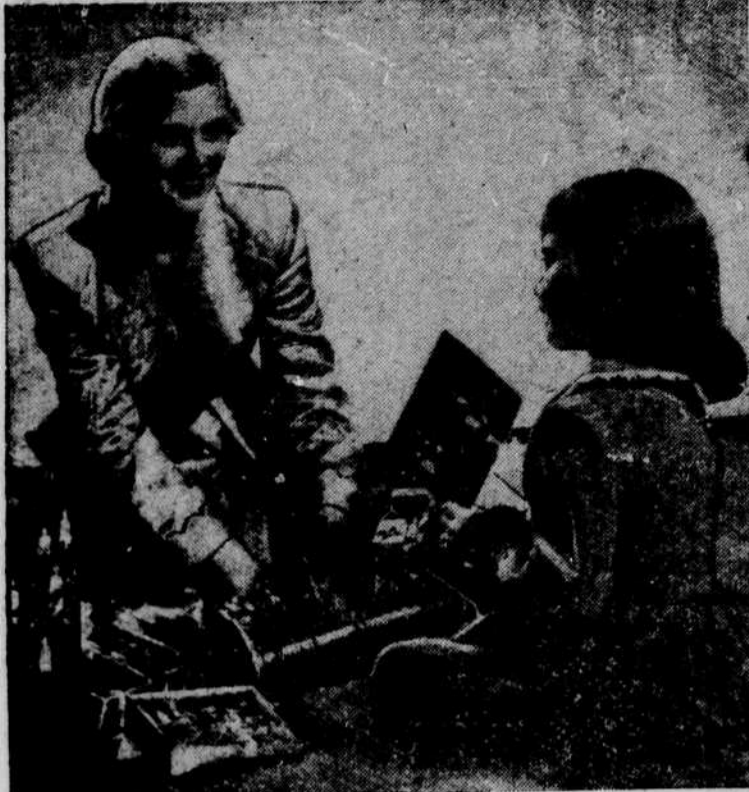
IT'S GIFT WRAPPING TIME AT CHRISTMAS and there's a jolly, heart-warming experience in store for all. For gifts wrapped with a thoughtful feeling for his (or her) personality and tastes brings the recipient close to your heart and makes wrapping as joyous an occasion and truly, almost as much fun as the giving. Above, "White Candles" wrapping paper from Norcross's Holiday Ensemble.

Perfect gift for a member of the campus-far-from-home crowd, is a tiny reading light that attaches directly to any book. Plugs into wall outlet and provides plenty of light for reading, yet will not disturb slumbering room mates.