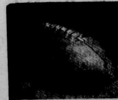
IMAGINE HIS JOY when he spies this handsome football, a real reproduction of those used on college teams. In genuine grained pigskin it's sized for small hands.