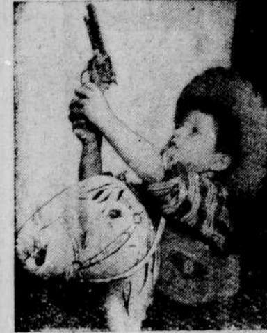
INFLATED PLASTIC horses may never gallop around the Christmas tree, but they give Junior the fun of playing cowboy and can be deflated for storing in a small area.