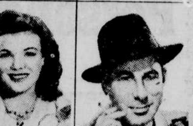
NADINE CONNER Opera's celebrated soprano