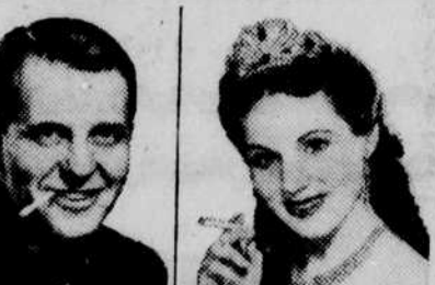
RALPH BELLAMY Stage and screen star