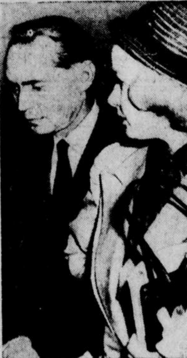
FIGURES IN a custody drama, screen actor Franchot Tone and his former wife, Jean Wallace, cross paths in a Santa Monica, Calif., courtroom where Jean is fighting for possession of their two sons. At the time of their divorce, the children were given to Tone who voluntarily agreed to share them with his ex-wife.