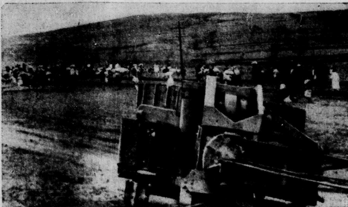
THE THIRD DESPERATE TREK STARTS for South Korean civilians along the railroad leading rearward from Seoul. Hundreds of thousands, who fled the city before the Reds captured it last summer, returned with the U.N. forces. With the Republican capital again menaced, the refugees flock over the same escape route. In the foreground, a British vehicle lies abandoned from the earlier fighting.