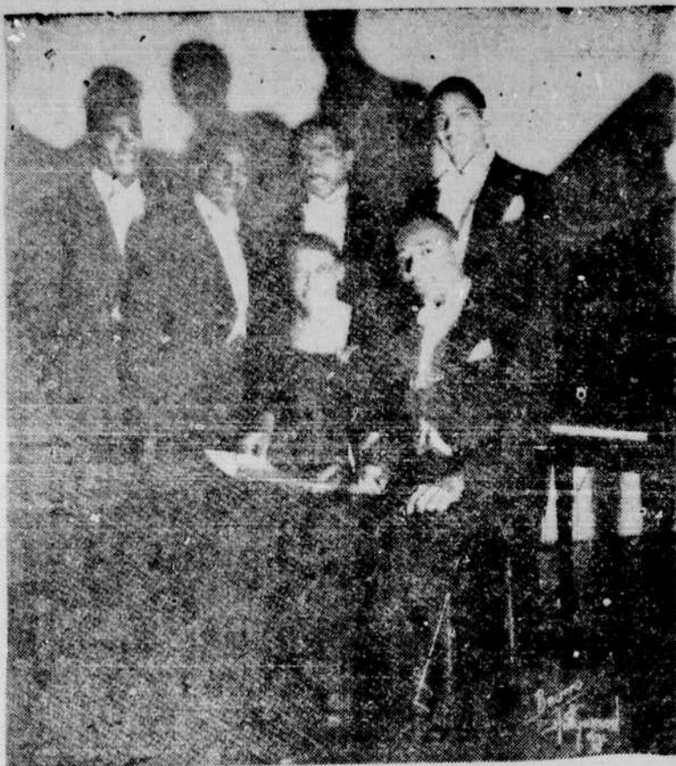
The Jubilee Singers will appear at the W. C. Chance high school in Parmele, Sunday, May 6th, at 7:30 p. m. Out of New York, this group of singers received their training at Fisk University.