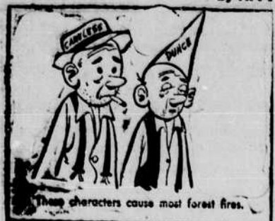
These characters cause most forest fires.