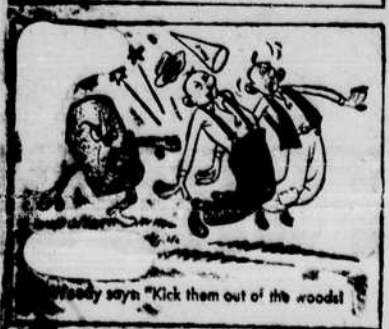
Woody says "Kick them out of the woods!"