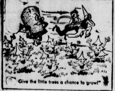
Give the little trees a chance to grow!

We can grow all the trees we need because we have plenty of forest land, sunshine and rainfall. Keep the forests growing!