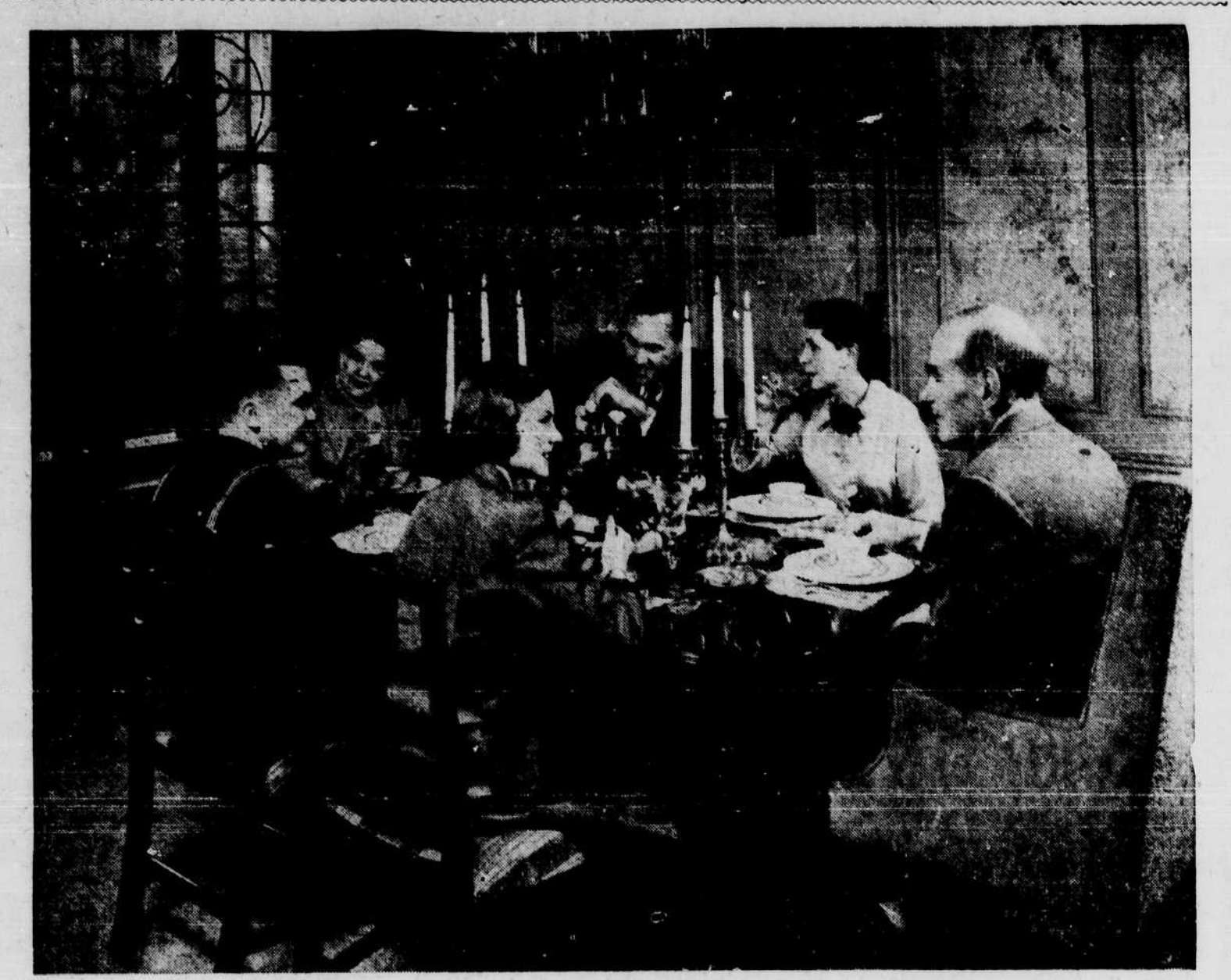
Sunday dinner is a fine old American family tradition - and never more festive these days than when one of the boys in the service comes home on furlough Stores throughout the country are this week showing new fall merchandise that will contribute mightily to the enjoyment of living at home. New suggestions for the serving of meals and snacks as well as gracious living in general are being shown. Home Fashion Time is being observed from September 20 through 29.

will not have to be present at the niture Company will give away a the world needs less