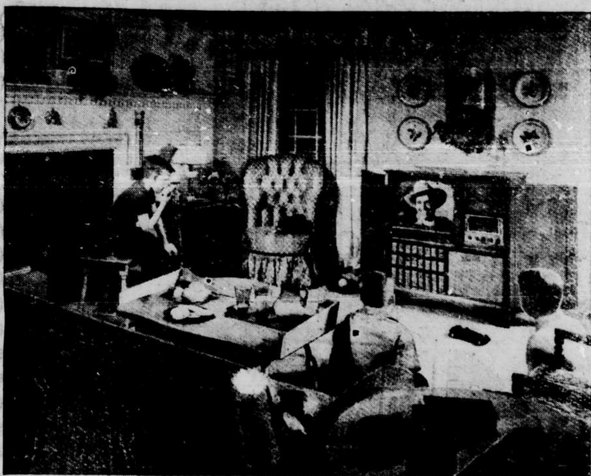
Here is an interesting television room arrangement in which a French Provincial receiving set blends effectively with Early American furniture. This room thus has two interesting focal points: The television set and the fireplace. Room arrangement is ideal for either children or adults. (Furniture: Consider H. Willett, Inc.; television: Magnavox.)