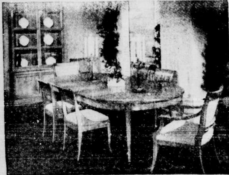
Modernist and Traditionalist are equally pleased with the subtle beauty of the Palladium Group. This fine furniture with its expert workmanship combines a feeling of country house simplicity and high sophistication. In addition the group includes pieces for living room and bedroom. (Baker Furniture, Inc.)