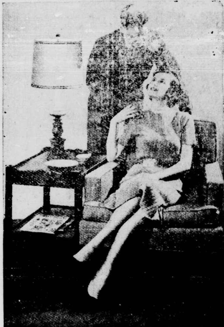
At home, and happy to be there! This easy chair provides just the right touch for couples looking for fine traditional furniture with a contemporary flair. Upholstered in a tweedy fabric it will blend well with any decor. The handsome Traditional table and lamp compliment the chair. (Heritage-Henredon)

Years ago Kipling defined a woman as "a rag, a bone, a hank of hair." Now one of our gal friends (platonic) in a Main street store come forth with this definition of man: "A brag, a groan, a tank of air."