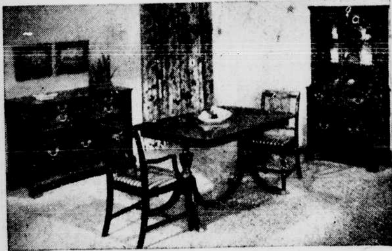
Styled especially to fit into the smaller home, this 18th Century Mahogany junior dining room suite combines Traditional beauty and solid construction and assures years of gracious dining. The buffet has lined and partitioned drawers for silver. The color is a rich red brown. (Broyles Furniture Factories)

In planning the curtain and drapery arrangements, do not concern yourself with the size and shape of the window. Rather, plan the design or composition of the whole window-wall and its relation to the entire room. The right decorative fabrics, simply handled, can make an outstandingly beautiful room.