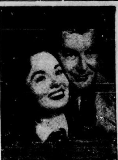
Ann Blyth and Philip Friend provide the romantic interest in Universal-International's new suspense film, "Thunder on the Hill," starring Claudette Colbert and Miss Blyth. Douglas Sirk directed. Showing Wednesday at the Watts Theatre.