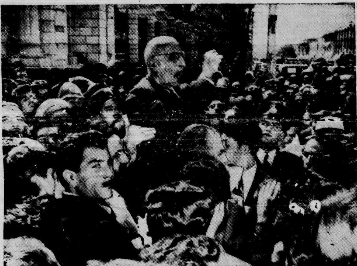
REITERATING HIS STAND on nationalization of Anglo-Iranian oil refineries, Iran's Premier Mohammed Mossadegh is surrounded by a crowd of demonstrators outside Tehran's Parliament Building. Meanwhile, the critical oil situation has been considered by the U.N. Security Council at Flushing Meadows, N. Y., and Mossadegh is expected to come to the U.S. to present his government's viewpoint to the group.