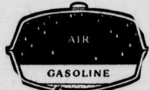
Water forms regularly by condensation in every car's gasoline tank—causes rust and corrosion throughout whole fuel system when you use ordinary gasoline.

Today ordinary gasoline has become old-fashioned. Today your Sinclair Dealer offers you POWER-PACKED Gasolines with an amazing EXTRA VALUE—a new chemical ingredient that solves the problem of rust and corrosion in your gasoline tank and fuel system. It's RD-119, a product of Sinclair Research.