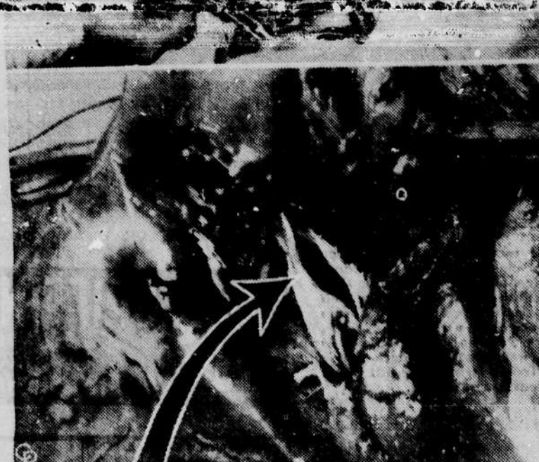
A HUMAN HEART makes its film debut as motion pictures of the inside of the vital organ in action are shown for the first time at New York's Montefiore Hospital. Produced by a medical research team, the important contribution to scientific knowledge was made possible by the employment of an artificial heart which supplied blood to the body but kept the heart area free from blood while the organ was being studied. At top, a surgeon holds the three cannulas, or tubes, leading from the lungs. At bottom is a close-up of areas surrounding the mitral valve (dark section indicated by arrow), which connects the upper and lower chambers of the organ. White areas are mural and aortic leadlets.