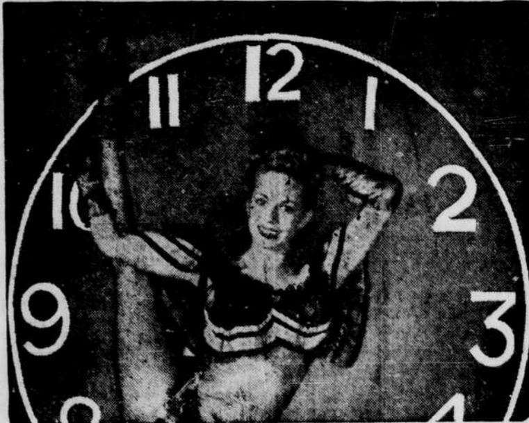
FIVE MINUTES MORE . . . Here's a clock with a hand like a foot, which doesn't seem to detract a bit from its face. If you can do this trick at five minutes to 12 on New Year's Eve, you're entitled to a Happy New Year.

The Soil Conservation Service was created by Congress in 1935.