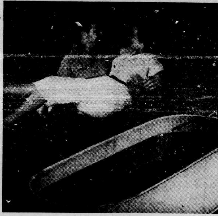
HE WOULDN'T DROP HER IN THE WATER TANK— or would he? This is one of the hilarious scenes in "Holiday for Bill"—romantic farm comedy film featured in the Ford Farming Festival.

Such a picture is Columbia Pictures' "Pickup," the low-down