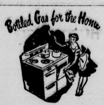
Better Living For You

Bottled gas is your quick. low cost solution to cooking and heating problems. Phone 2572.