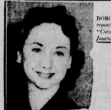
DOROTHY KILGALLEN, famed columnist who reported the presentation of the Red Cross Shoe "Coronation Collection" in The Ladies' Home Journal .