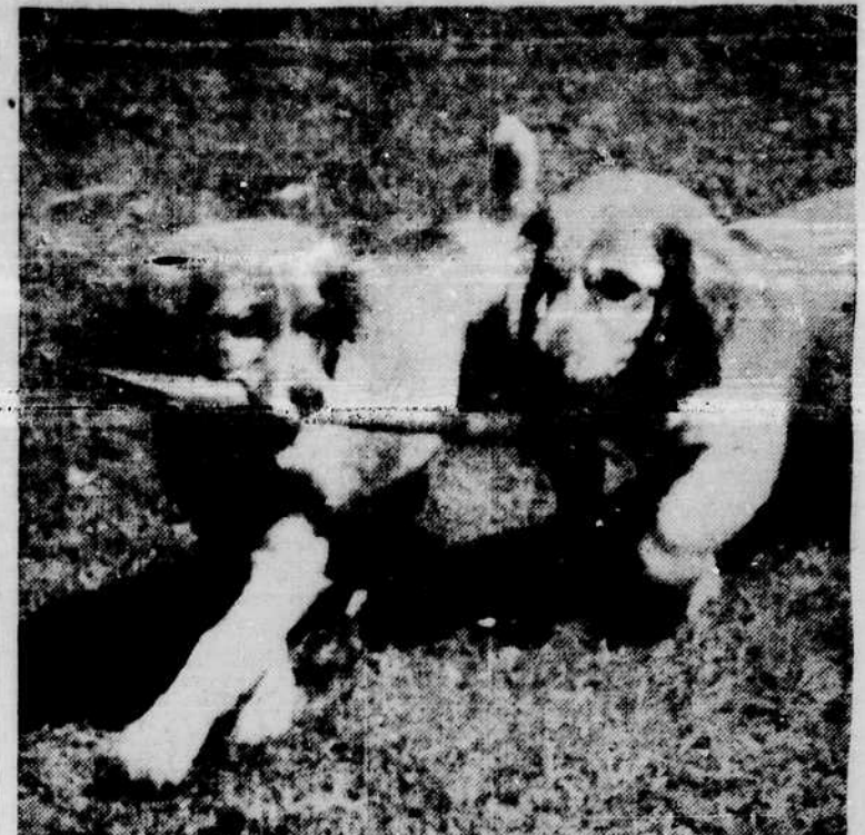
won the Grand Prize in the animal class of the 1951 National High School Photographic Awards.