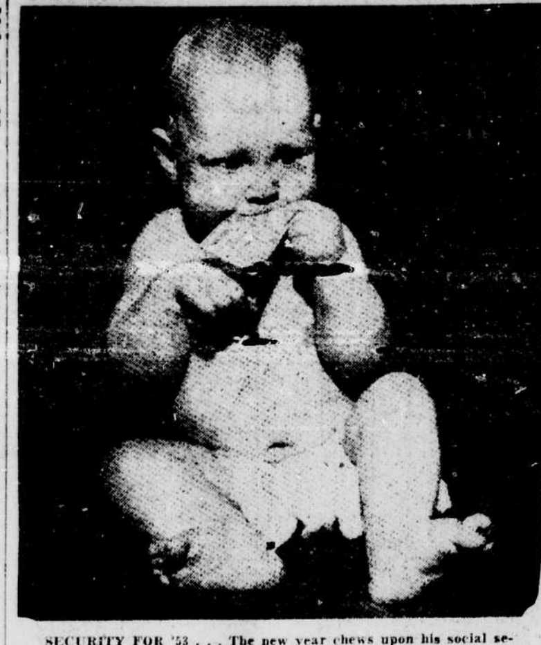
SECURITY FOR '53 . . . The new year chews upon his social security card and ponders upon what his future will hold for the next 365 days. Anyway, he knows he will be ready to retire next December 31, and he plans to draw his old age pension and let another year do all the work after that.

our yet unmastered international society, seek to prevent both the destruction of human freedom and the self-destruction of civilization and to share their generous strength for peace on earth and good will among men. In a dynamic world, in which a depression or a war anywhere involves human beings everywhere, the people of the American dream, against the lags of the conceptions of the absolute state, the superior