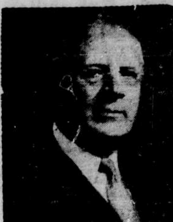
Bishop Edwin E. Voigt of the Dakotas Area, will lead a mass rally at East Carolina College stadium for thousands of Methodists in this section Sunday afternoon at 3:30 o'clock.