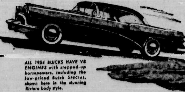
ALL 1954 BUICKS HAVE V8 ENGINES with stepped-up horsepower, including the low-priced Buick Special, shown here in the stunning Riviera body style.

Instant new response on getaway. Cyclonic new power in one single, sweeping, velvet stroke from standing