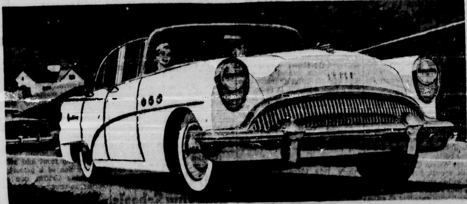
The phenomenal 200-hp Buick Century—highest-powered car at its price in America.