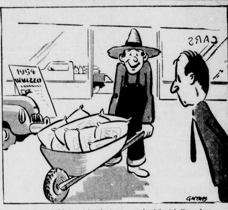
"My neighbor said only $400 worth of Smith-Douglass Fertilizer bought him a new car.'

to $114,758,444. 4:30 Love of God 5:00 Sign Off