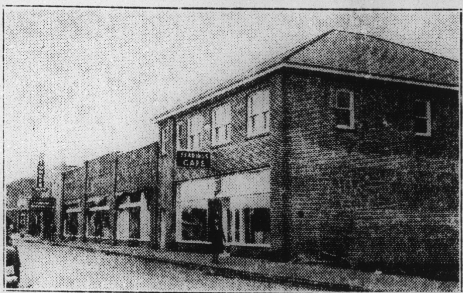
The large two story building in the foreground is the Fearing restaurant and office building. It contains one of the finest cafes in the state. It is a part of the Fearing building which adjoins it and houses three stores, and is the largest business structure in the town of Manteo.

is all puffed up, and thinks he could be Senator as well as Governor. He may not even demand any counter damages, for many a younger man about town is envious of him.