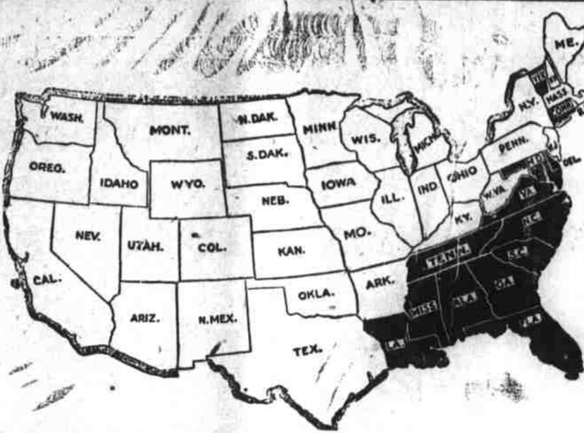
The 35 White States Have Ratified. Make North Carolina the Perfect 36.