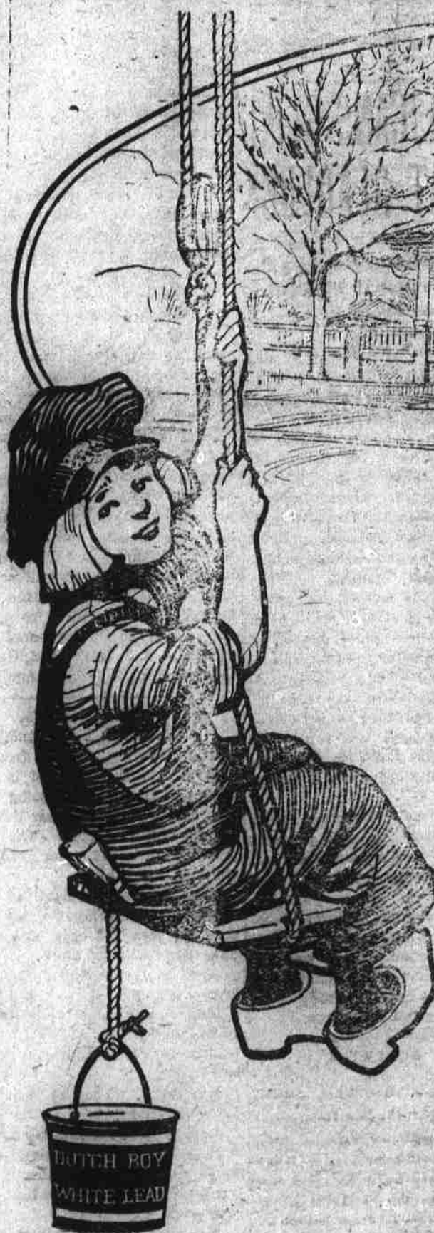
Save the surface and you save all to save the surface. White-Lead it.

We Sell Dutch Boy White Lead With the Spring Coming, a New Coat of Paint Should Come Also LET US FILL YOUR REQUIREMENTS MARROW-PITT HARDWARE CO.