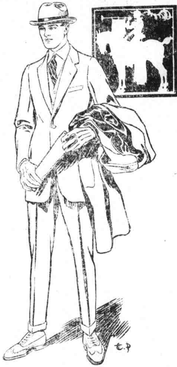
Copyright 1921 Hart Schaffner & Marx