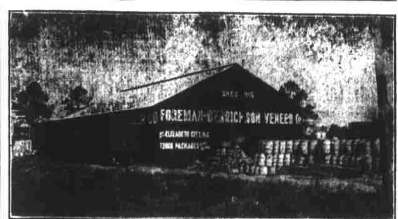
ASSEMBLING PLANT Near Norfolk Va.

SPECIALIZE— PEA BASKETS AND POTATO BARRELS