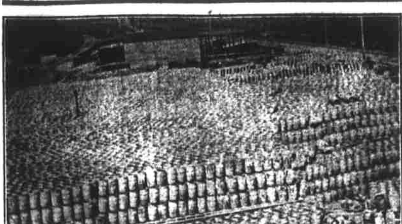
BARREL YARD and HEADING MILL

SPECIALIZE— PEA BASKETS AND POTATO BARRELS